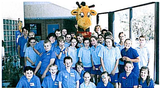
Adopt a class logo AND Students from Elmore Vale Public School with Healthy Harold.

For information: www.hunterlifeeducation.org.au