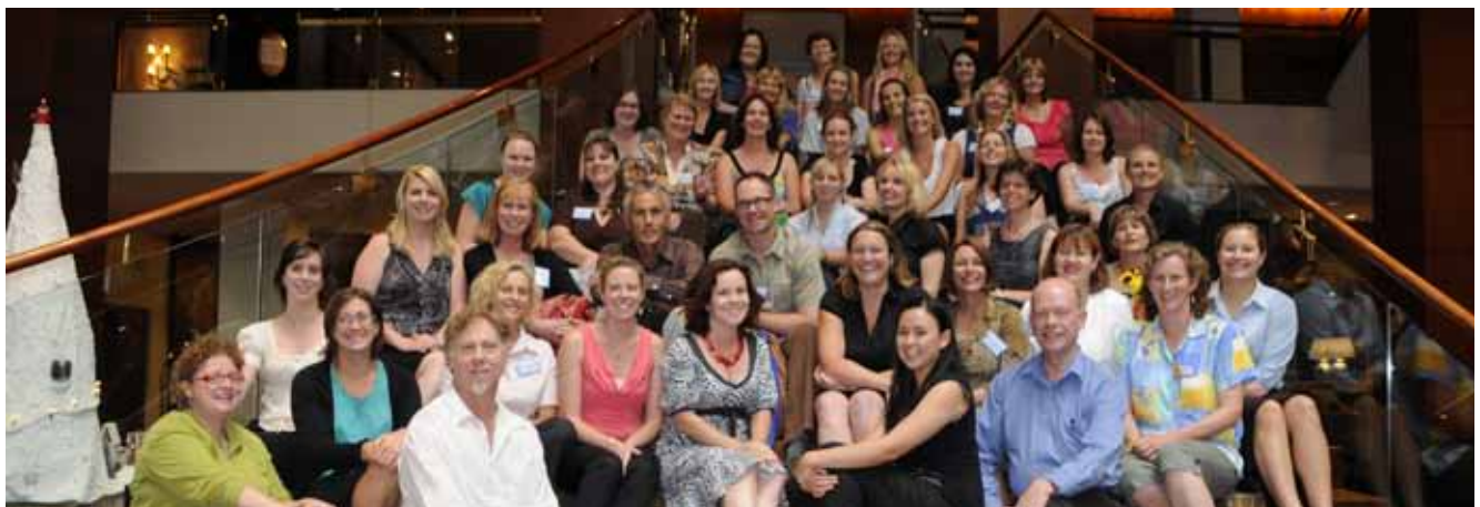
New South Wales Educators and staff took the opportunity for a Kodak Moment in the lobby of the Four Seasons Hotel