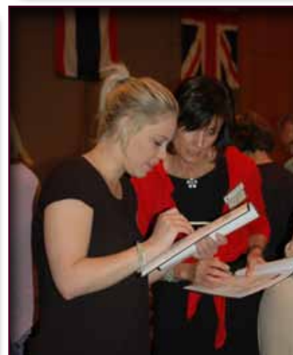
Educators busy exchanging ideas and teaching techniques at the Andrew Fuller workshop